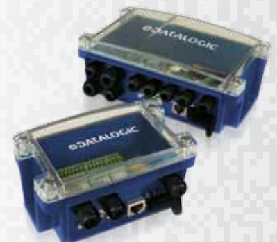
AL5010 INTERFACES MODULE